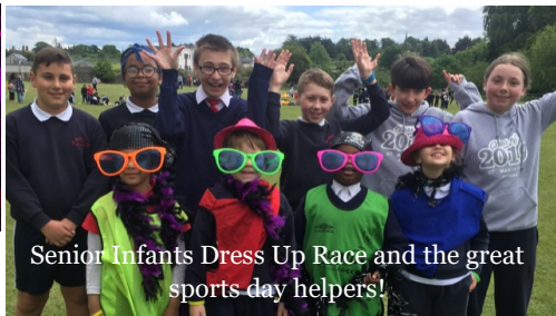
Senior Infants Dress Up Race and the great sports day helpers!