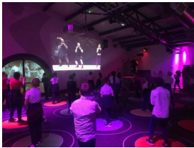
Body Combat Class in Regional Sports Centre

Active Week, Sports Day, WAMWAS & Sponsored Walk May 2019 Our active Schools Team scheduled a very busy Active Week 27th–30th May for us all this year. Each day started out at 9.30am on the pitch with WAMWAS—Walk a mile with a smile. This was enjoyed by all and was a great way for children and staff alike to start their day. Many classes walked to the Regional Sports Centre to take part in Body Combat Classes also. Our Junior Sports Day was held on Tuesday 28th May and was a great success with junior pupils partaking in Dance, Novelty Games, Obstacle Races, Dress Up Races, Throwing Games, Parachute Activities and other fun relays. Senior Sports will be held very soon and senior children can look forward to a day filled with Penalty Kicks, Hurling, Tug-O-War, Novelty Games, Basketball, Obstacle Race and other relay activities. Our Active Week came to a close with a Whole School Sponsored Walk along the Greenway on Thursday 30th May. Well done to all as we collected €2,685 in funds for the school through sponsorship cards—it is very much appreciated and our pupils will reap the benefits!